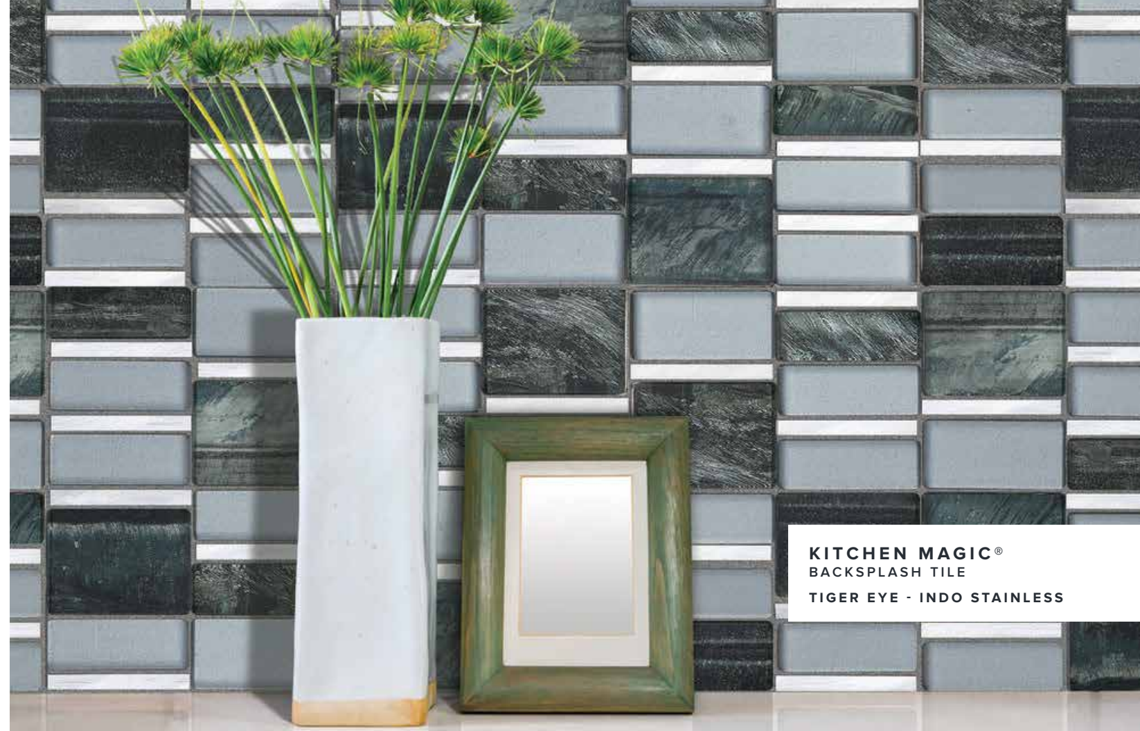
KITCHEN MAGIC® BACKSPLASH TILE TIGER EYE - INDO STAINLESS