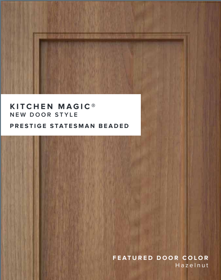
KITCHEN MAGIC® NEW DOOR STYLE PRESTIGE STATESMAN BEADED

For the last few years, the standard craftsman/shaker door has been our most popular style. What we’re seeing for 2020 are additional details. The beaded door adds more pop and depth to the classic shaker door style.